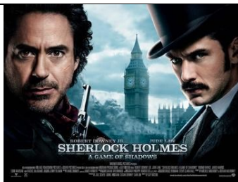
Film number : 5