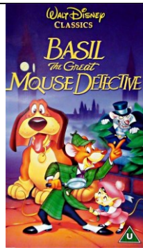
Film number : XX