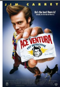
Film number : 1