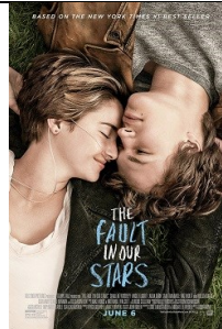
Film number : 3