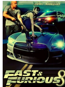
Film number : XX