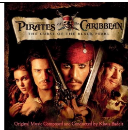
Film number : 4